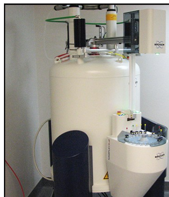
400 MHz Bruker NMR