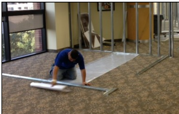
Dallas Southwest Campus construction in progress will greatly benefit the programs soon.

In Abilene, $610,000 was put into equipment for the new sterile products lab, $80,000 is going into an improved water system, and $908,520 has been provided by the Develop-