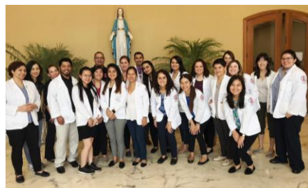
SNPhA members vaccinate over 200 at the annual Vietnamese Martyrs Catholic Church Health Fair. Nov. 2019