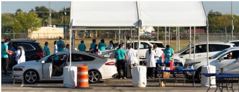
1100+ flu vaccines given in University Health System free drive-through clinic. 15 FSOP students volunteered to serve. Nelson Wolff Stadium Oct. 2020