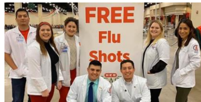
Feast of Sharing held by H-E-B, APhA students volunteer over Christmas break and vaccinate 400. Dec. 2019