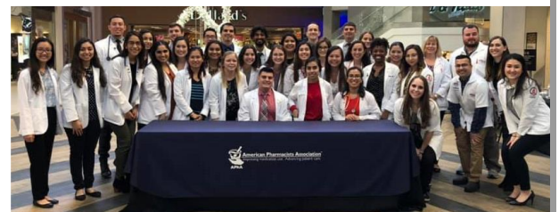
APhA students provide flu shots & medical screenings for 150 – fall Ingram Park Mall Health Fair. Nov. 2019