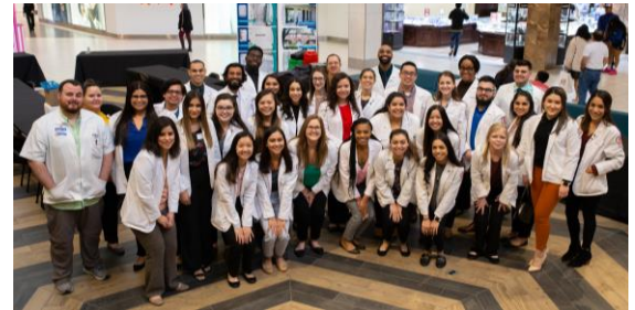
Spring Ingram Park Mall Health Fair – APhA students vaccinate and screen 120 attendees. Feb. 2020