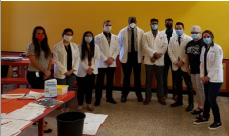
Sponsored by H-E-B, Phi Delta Chi students vaccinated 100 attendees at Las Palmas H-E-B. H-E-B. Oct. 2020