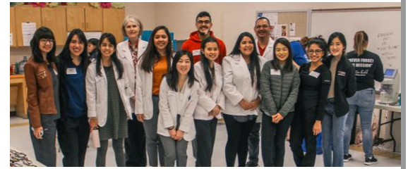
Kappa Psi students on ARISE Winter Health Mission Trip to the Rio Grande Valley, with teams from Optometry, Nursing, Ettling Center and College of Humanities. 340 community members received free screenings, flu vaccinations and prescription eyeglasses, providing a total value of care of $125,000. Dec. 2019