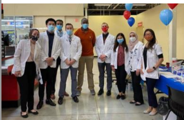
PDC students gave flu shots to 100+ at H-E-B Zarzamora. Oct. 2020