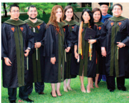
Pan Am Cooperative Program graduates