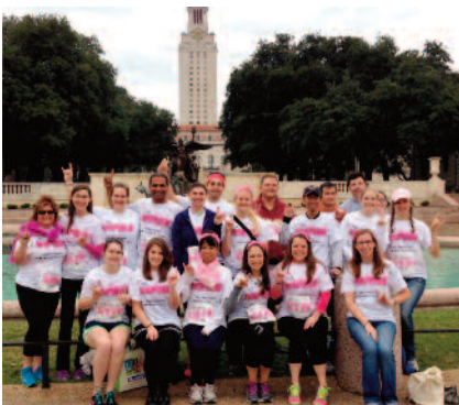
Race for the Cure