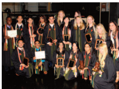
Student award recipients