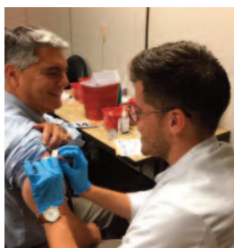
President to president