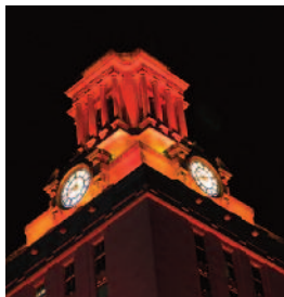
Tower honors NCPA team